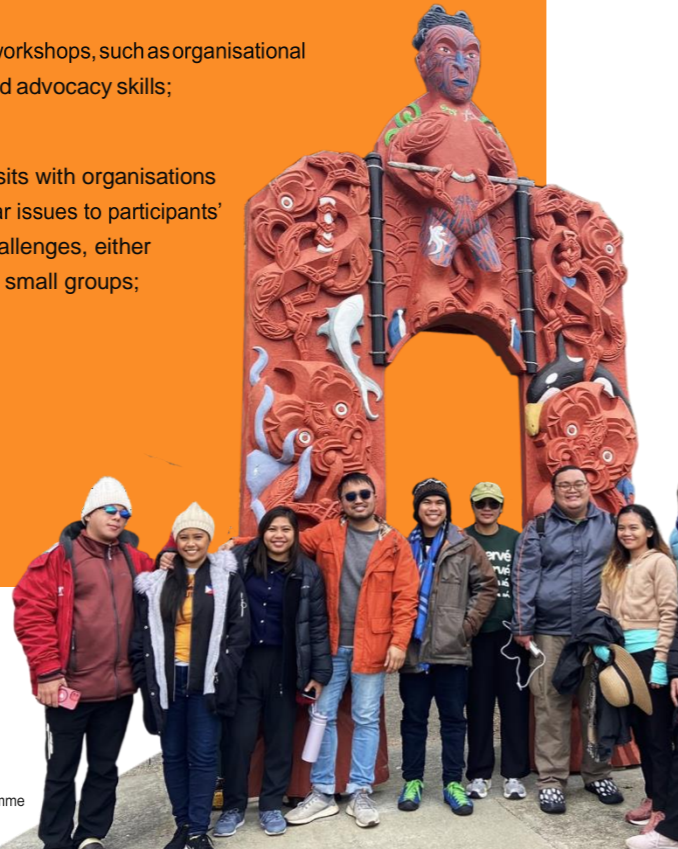
7 Cambodia Laos Young Leaders Programme