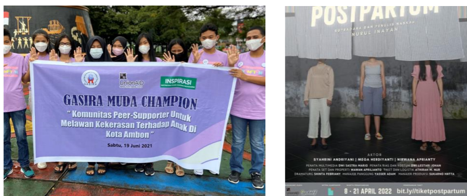
9 Cambodia Laos Young Leaders Programme