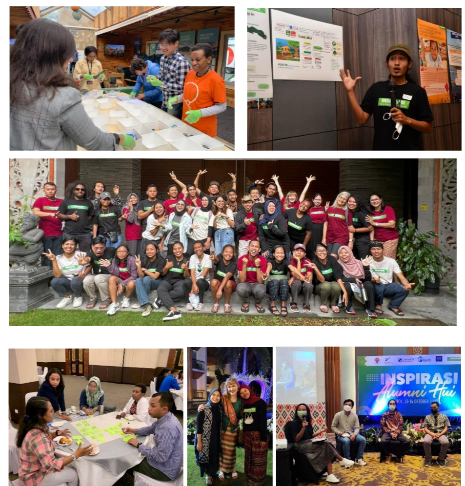
2024 Prospectus 10

Alumni also become part of the wider UnionAID young leaders network and can engage with their peers from the Myanmar, Indonesia and Mindanao (Philippines) Programmes.